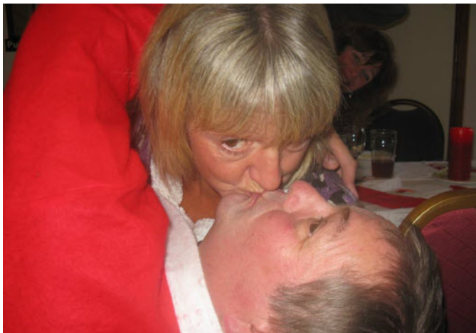
Lust - the Stolen kiss - quick no-one is looking!!

Love is in the air!!!! With Valentines day just passing are the bashers becoming a romantic bunch of people? It appears that there is defiantly romance in the air!!!! But what does the kissing style say about them?