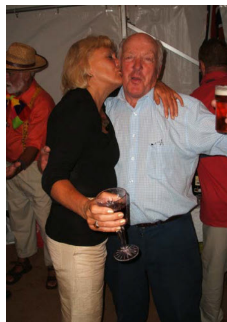
Forbidden love - But Father is just happy that he's still young enough to pull!!