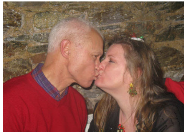
The serious kiss - wait till I get you home!!